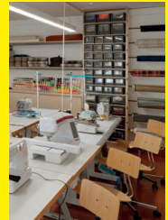
STUDIO ITS Arcademy features a fully equipped creative Studio. Open during workshops