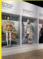
WUNDERKAMMER Exhibition space