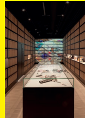
LIBRARY The heart of ITS Arcademy contains approximately 8,000 of the 15,000 portfolios in the Collection