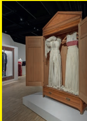
GALLERY Exhibition space