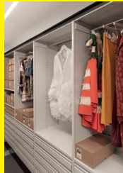
ARCHIVE The Archive houses the ITS Collection, supported by Generali